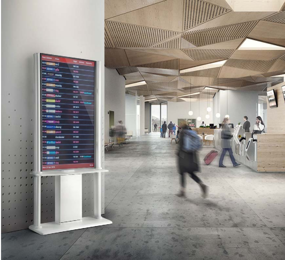
Indoor Digital Signage Kiosk Stand LDS01-55F

LUMI (Lumi Legend Corporation – Hall 1/2, Booth 1-E60/E70 & 2-E60 ), the leading exporter of A/V Mounting Solution products, is pleased to introduce the new indoor digital signage kiosk stand LDS01-55F.