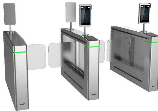
DS-K5603-Z with access turnstile

During rush hours, access turnstiles equipped with Hikvision's face recognition terminals can respond in less than a half-second, passing up to 40 persons per minute.