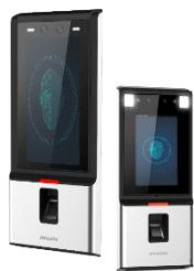
DS-K1T604MF & DS-K1T606MF