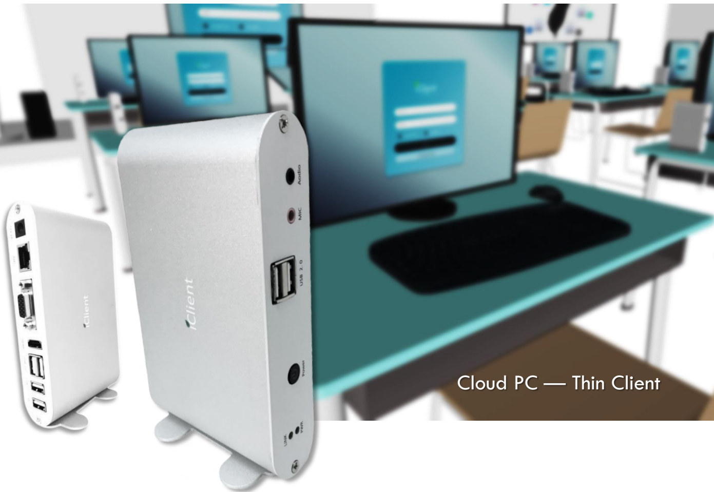
Cloud PC — Thin Client

Efficient management, combination of Green and IoT, It can help users to go Green and attain the most efficient using experiences.