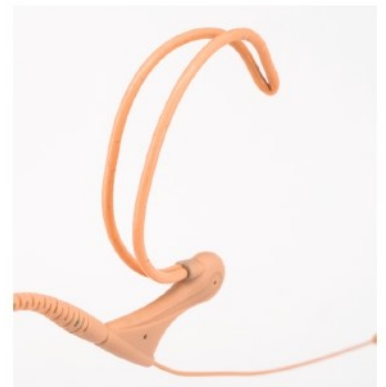
Elastic Double-line Design